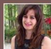
Aiflna QOSE Training & Assessment Centre