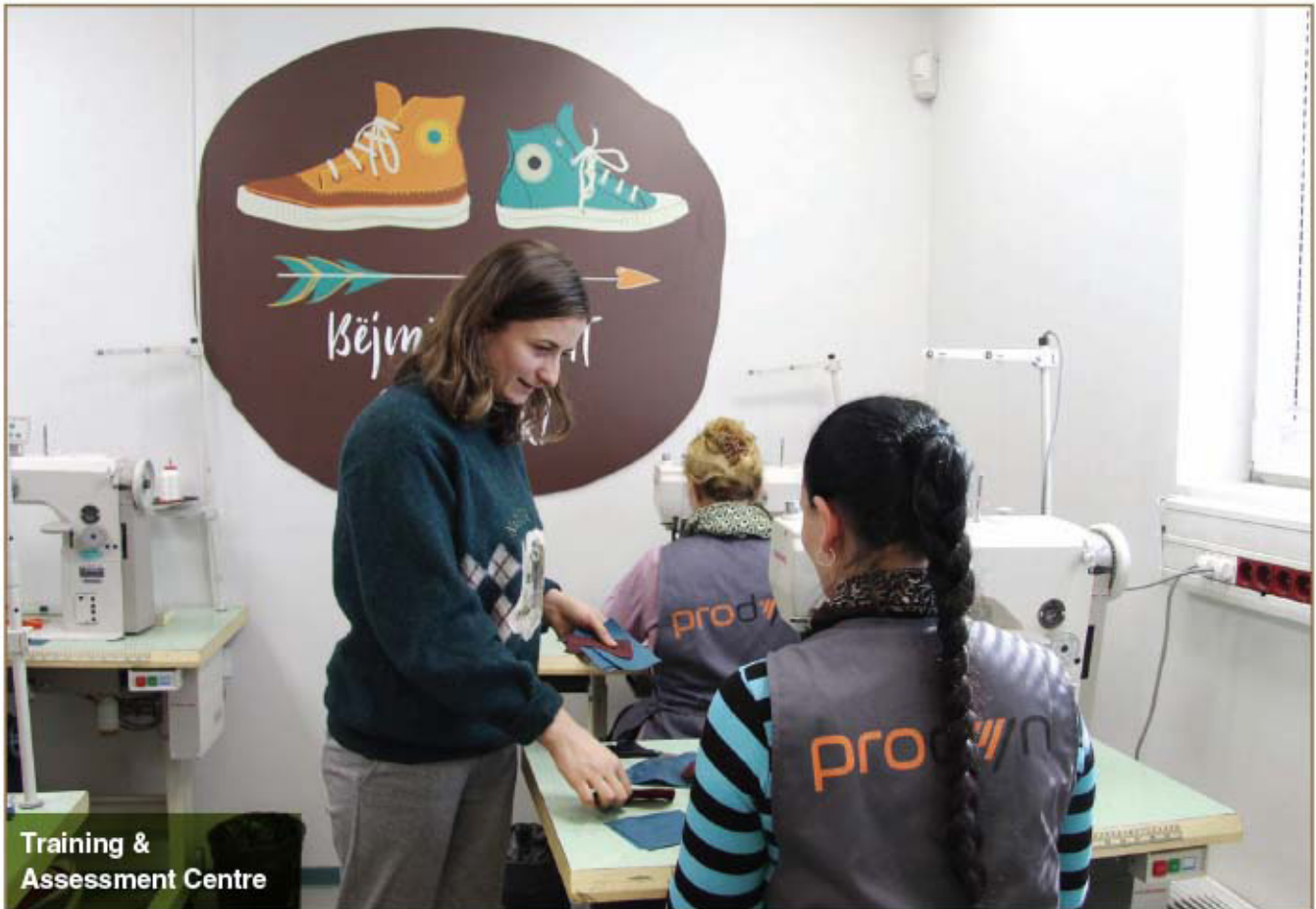
Training & Assessment Centre