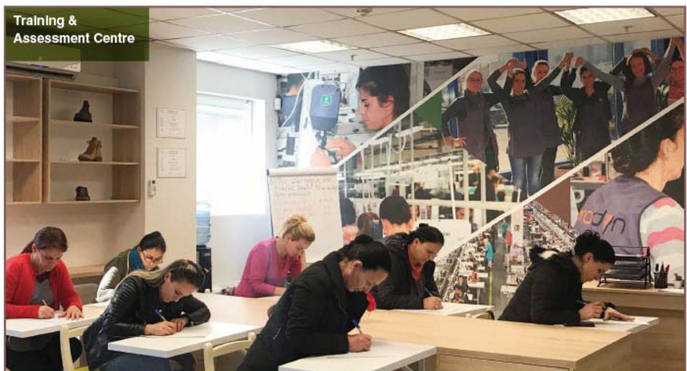
Training & Assessment Centre