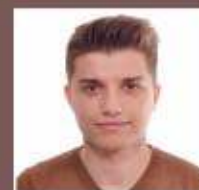
Reixhi MEMO Operation/SOP