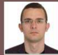
Aibi BUSHI Operation/SOP